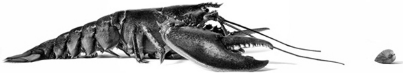
Lobster vs. Clam